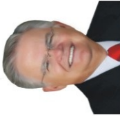
Pastor John Hagee